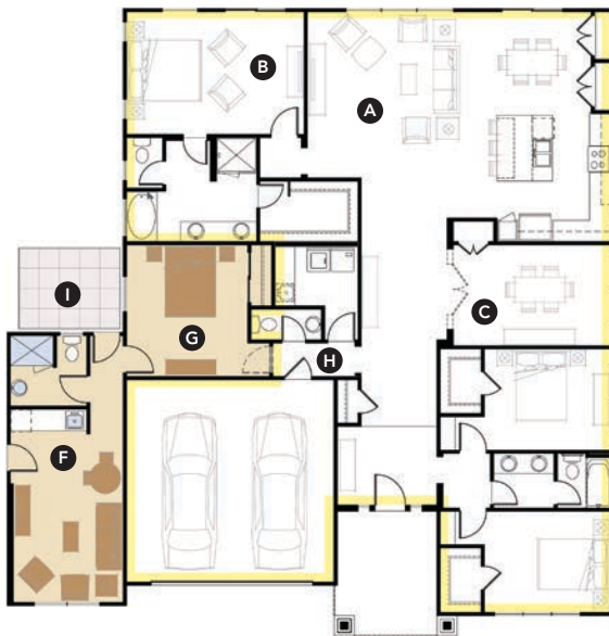
ONE BEDROOM APARTMENT OPTION